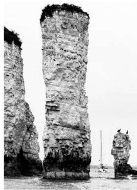
Harvie Woolley, Cruising Sub-Committee