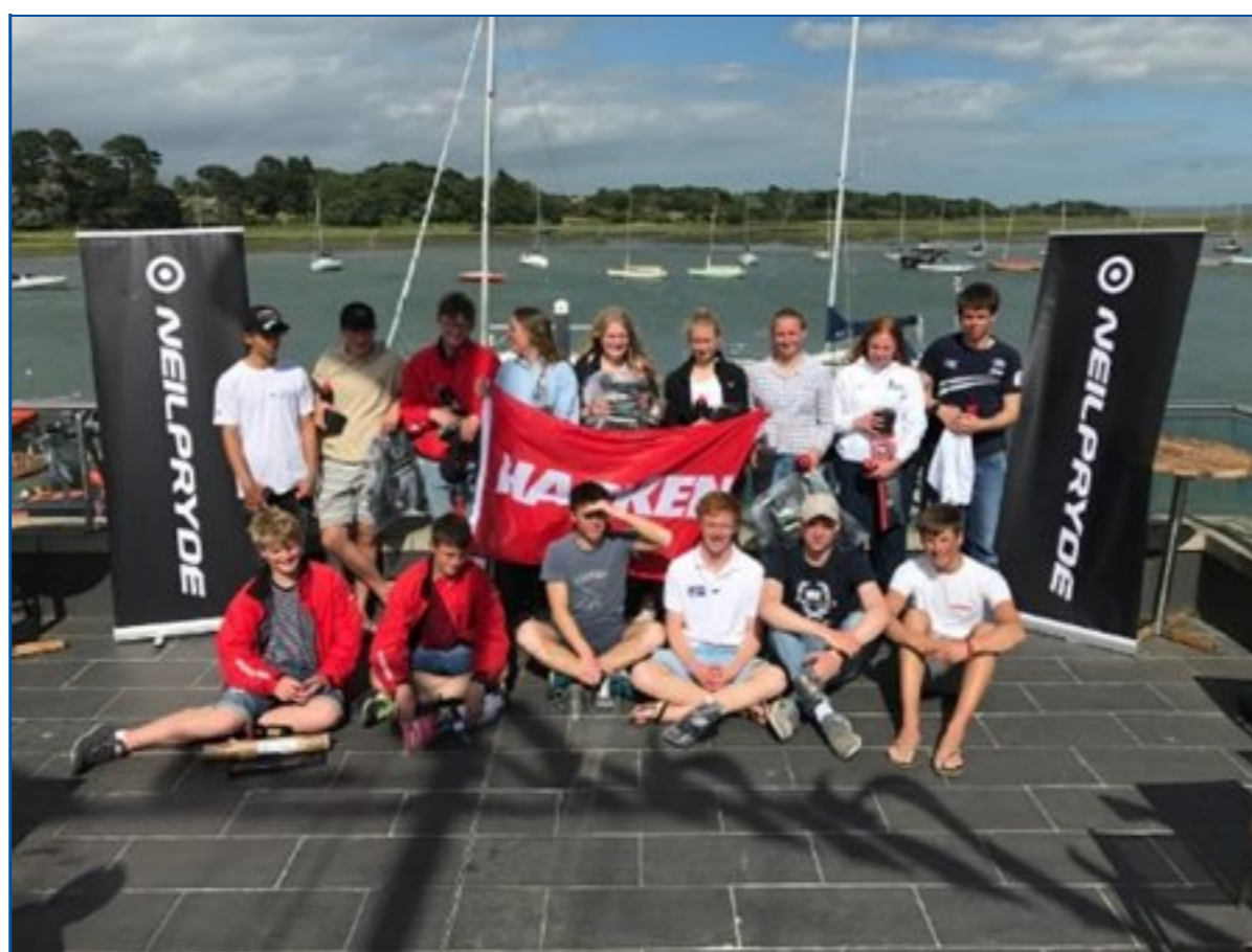
Prize winners on the club balcony